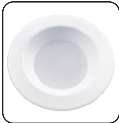
New Smooth housing for new designer look.