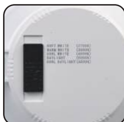
A five ezCCT color selectable switch to brighten up any room.