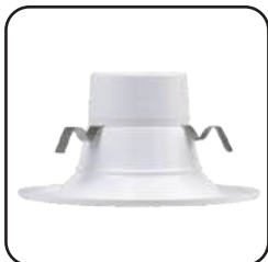
A compact 4 inch housing base retrofit kit.