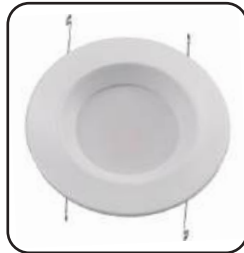
New Smooth housing for new designer look.