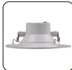
A compact 6 inch housing base retrofit Kit