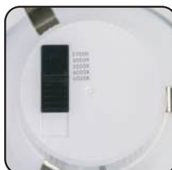
A five ezCCT color selectable switch to brighten up any room.